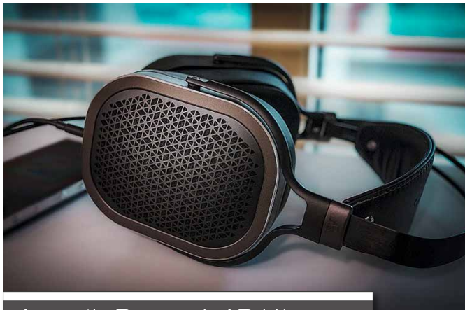
Acoustic Research AR-H1

EAR IN Referenzklasse 1,3 Das Kopfhöremagazin 1/2018 Preis/Leistung sehr gut